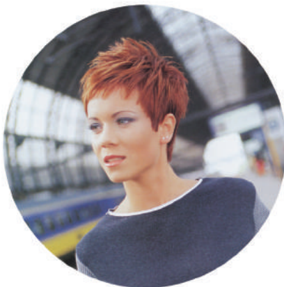
Design Forum 266