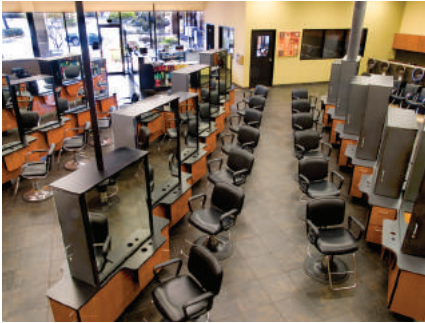
North Austin location

Both institutions are located in modern shopping centers and are reached by two major freeways. Bus routes are in walking distance. We have student lounge areas for lunch and there are many nearby restaurants.