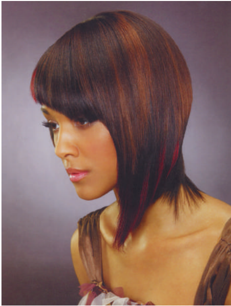
Design Forum Eutectic