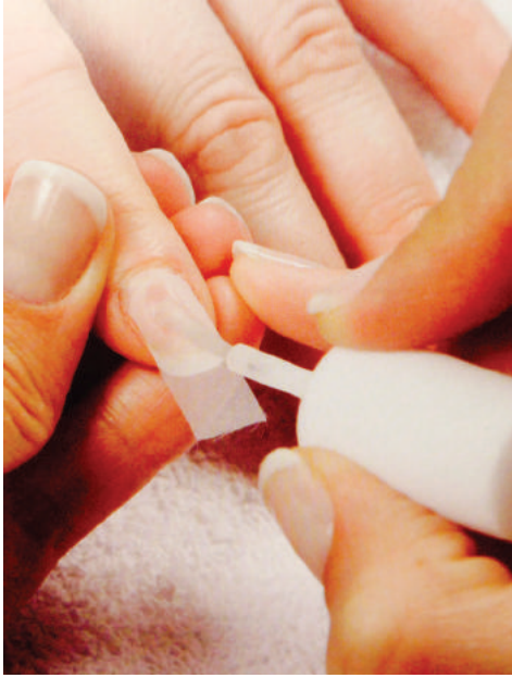
Nail Wrap Over-layer